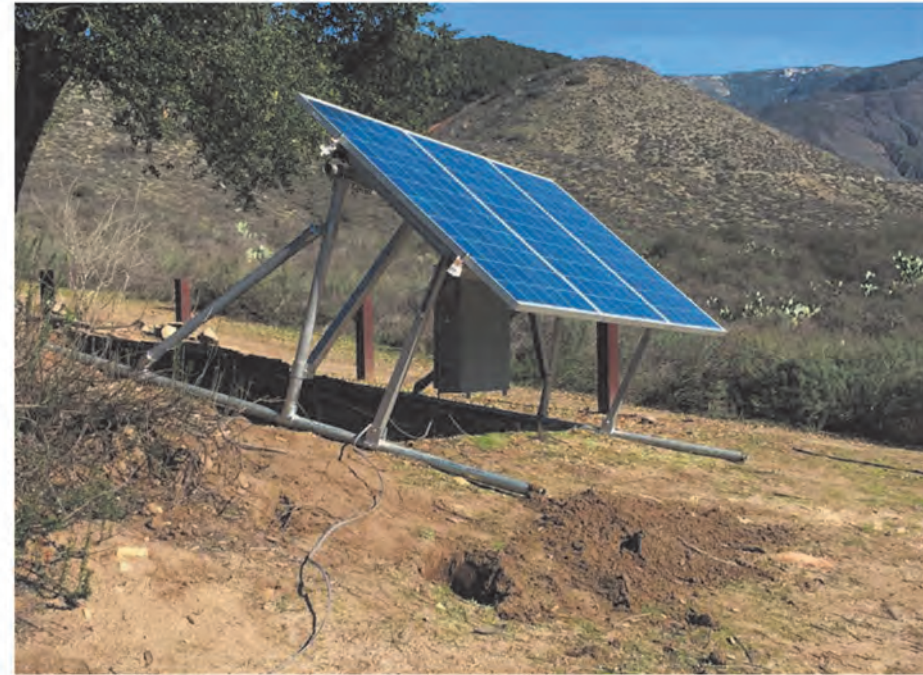
Portable OFFGrid Array demonstrated at Earth Day